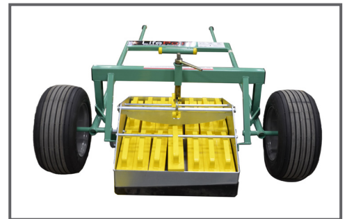
To move cart, position cart, raise DynaWeight, and move to new location.