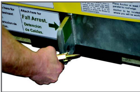
Your lanyard can connect to either the fall-restraint or the fall-arrest.