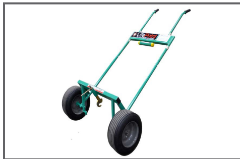
Optional Transport Cart