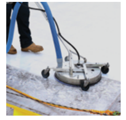
Step 1: Clean with RoofTec™