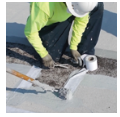
Step 2: Detail with Geogard Seam Sealer