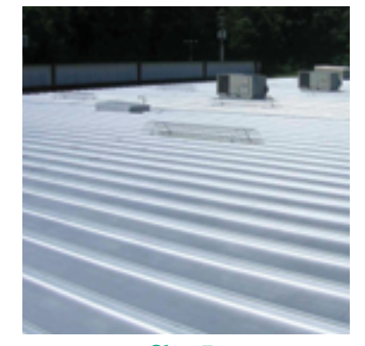
Step 3: Apply One Coat Alumanation 301