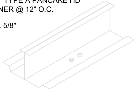
ULTRASPAN CLIP 2-PIECE (24GA) (4) FASTENER REQUIRED PER CONNECTION (2 PER SIDE)