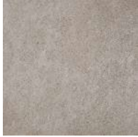
PT-24-BISON TRUST SILVER