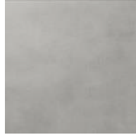
PT-24-BISON BOOST BAL GREY