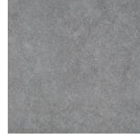
PT-24-BISON SEASTONE GRAY