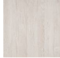
PT-24-BISON AXI WHITE PINE