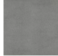
PT-24-BISON BLUESTONE PT-48-BISON BLUESTONE*