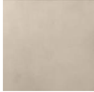
PT-24-BISON BOOST BAL ASH