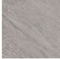
PT-24-BISON BRAVE PEARL* PT-48-BISON BRAVE PEARL*