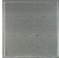
PT-TRAY-2424 PAVER TRAY