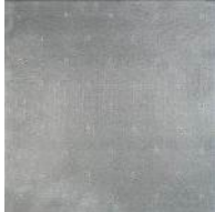
PT-BACKER-2424 PAVER BACKER