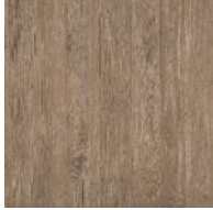
PT-24-BISON AXI BROWN CHESTNUT