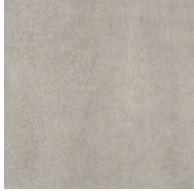
PT-24-BISON MARK CHROME PT-48-BISON MARK CHROME*