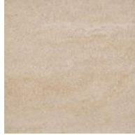
PT-24-BISON TRUST GOLD*