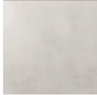
PT-24-BISON BOOST BAL PEARL