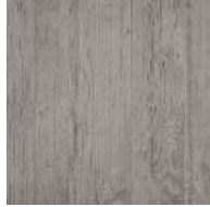
PT-24-BISON AXI GREY TIMBER