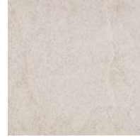
PT-24-BISON BLOCK BIANCO